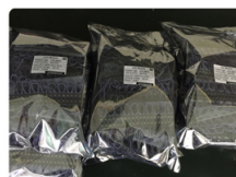
Anti-static bag package