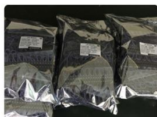
Anti-static bag package