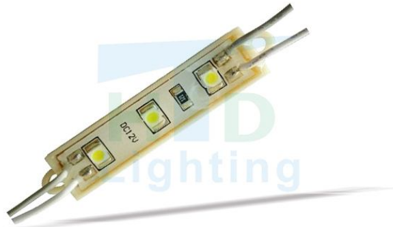
*HTD-39123 LED MODULE