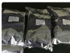
Anti-static bag package